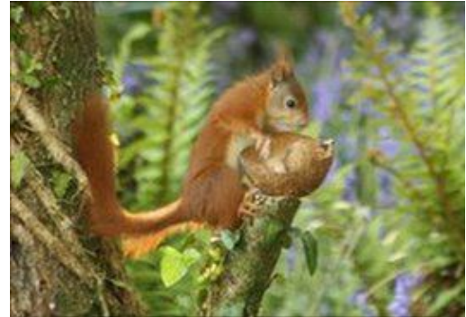
Red squirrel in Menai Bridge garden 2011

The following organisations have funded the Anglesey red squirrel project 2011-2014: