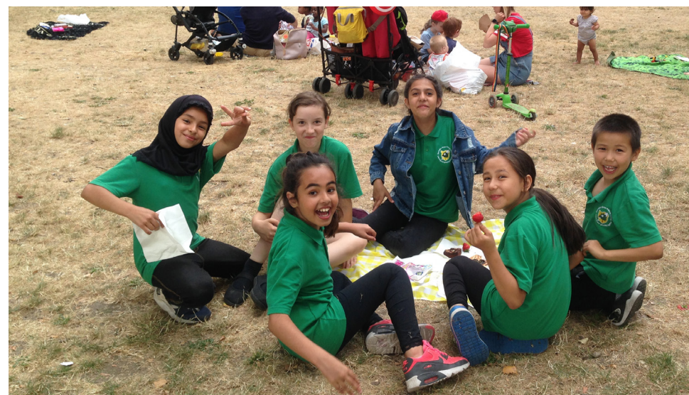
'Picnic on the Green', a community event on Newington Green N1