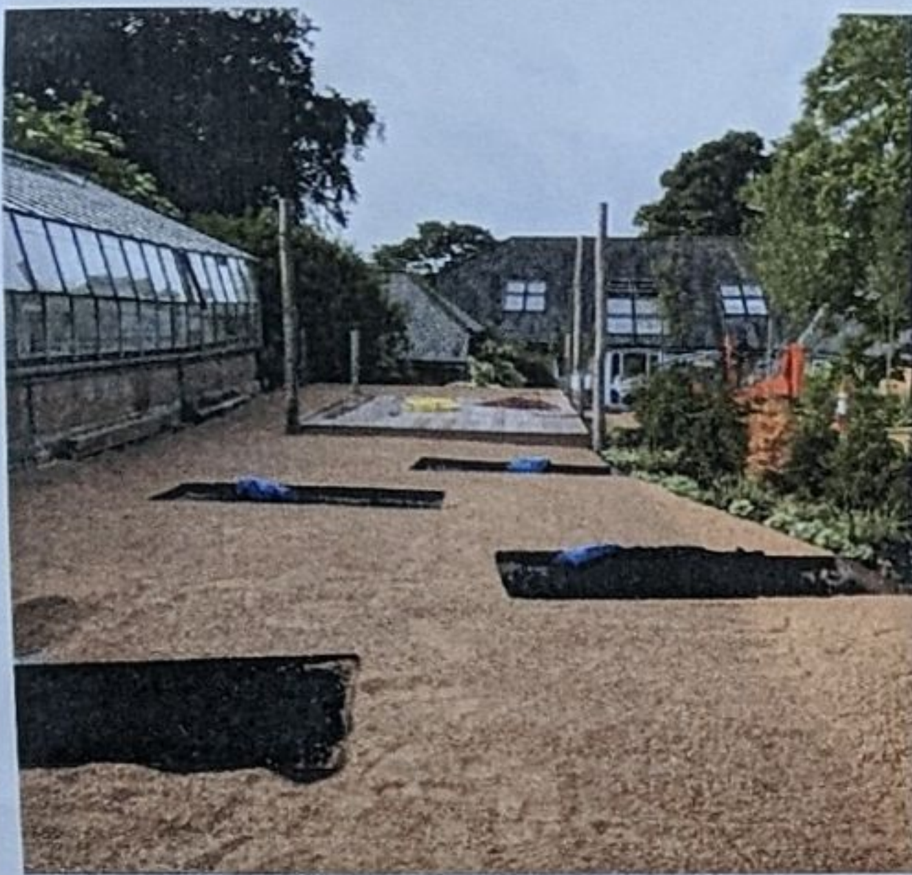
physic garden under construction