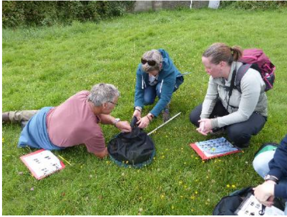
Bumblebee survey at Frog Pond Wood