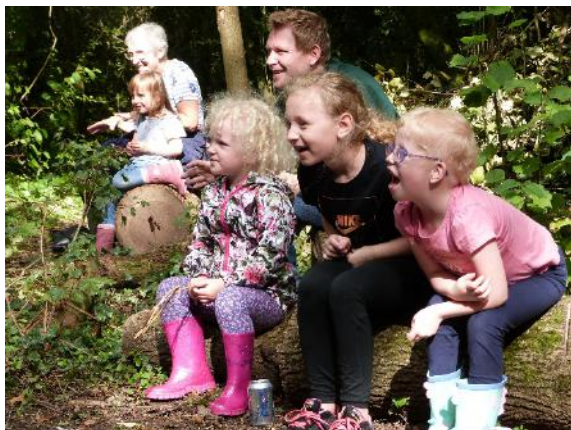
Storytelling at Tremains Wood

Partnerships with these organisations have taken time to develop and we felt that it was appropriate to carry out ‘consultation’ workshops to enable the leaders and the beneficiaries to share their interests and views of local green space, thereby developing activity ideas in an inclusive and effective way. This was carried out with Mental Health Matters in two locations – central Bridgend (in relation to engagement at Craig y Parcau) and Porthcawl (in relation to engagement at Locks Common) and also with Families First where we spent time with staff and families during a welly walk in Bryngarw. This process has meant that we better understand the barriers faced by these groups and are more confident that the activities we are running in autumn are appropriate and inclusive.