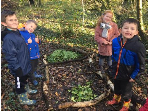
Tremains Primary School in Tremains Wood