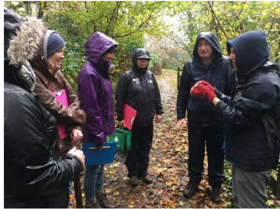
Winter Tree Identification at Craig y Parcau