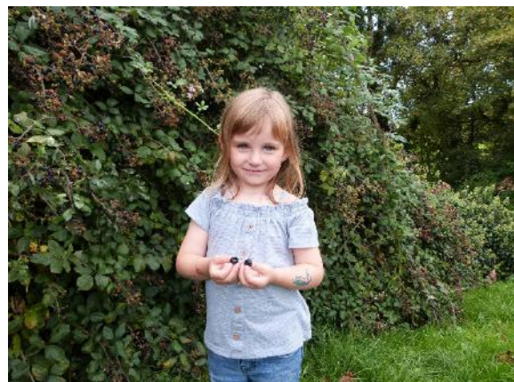
Blackberry picking at Tremains Wood