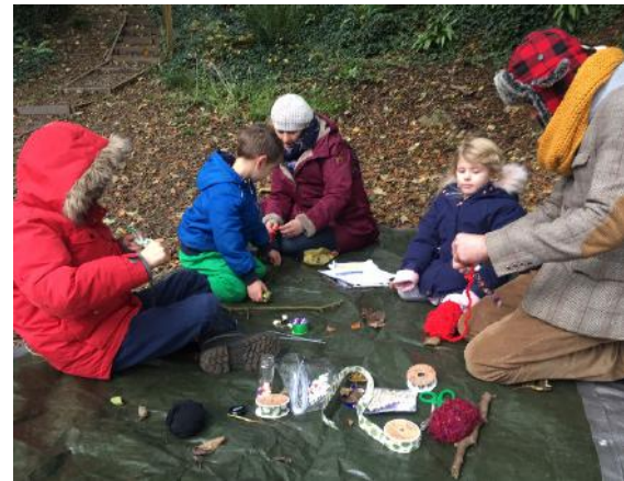
Autumn Activity Morning at Craig y Parcau