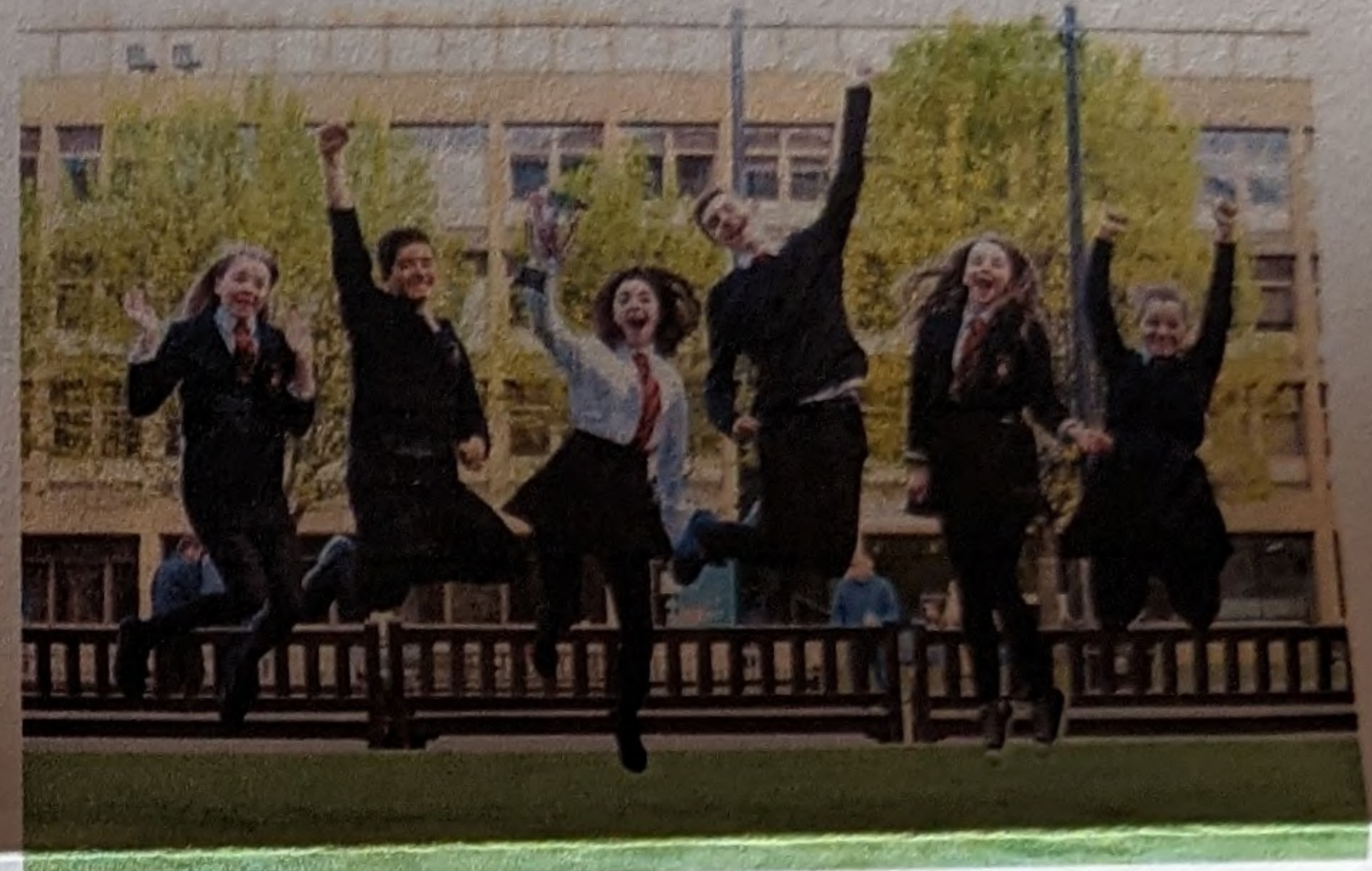
Industrial Cadets Bronze winners celebrating