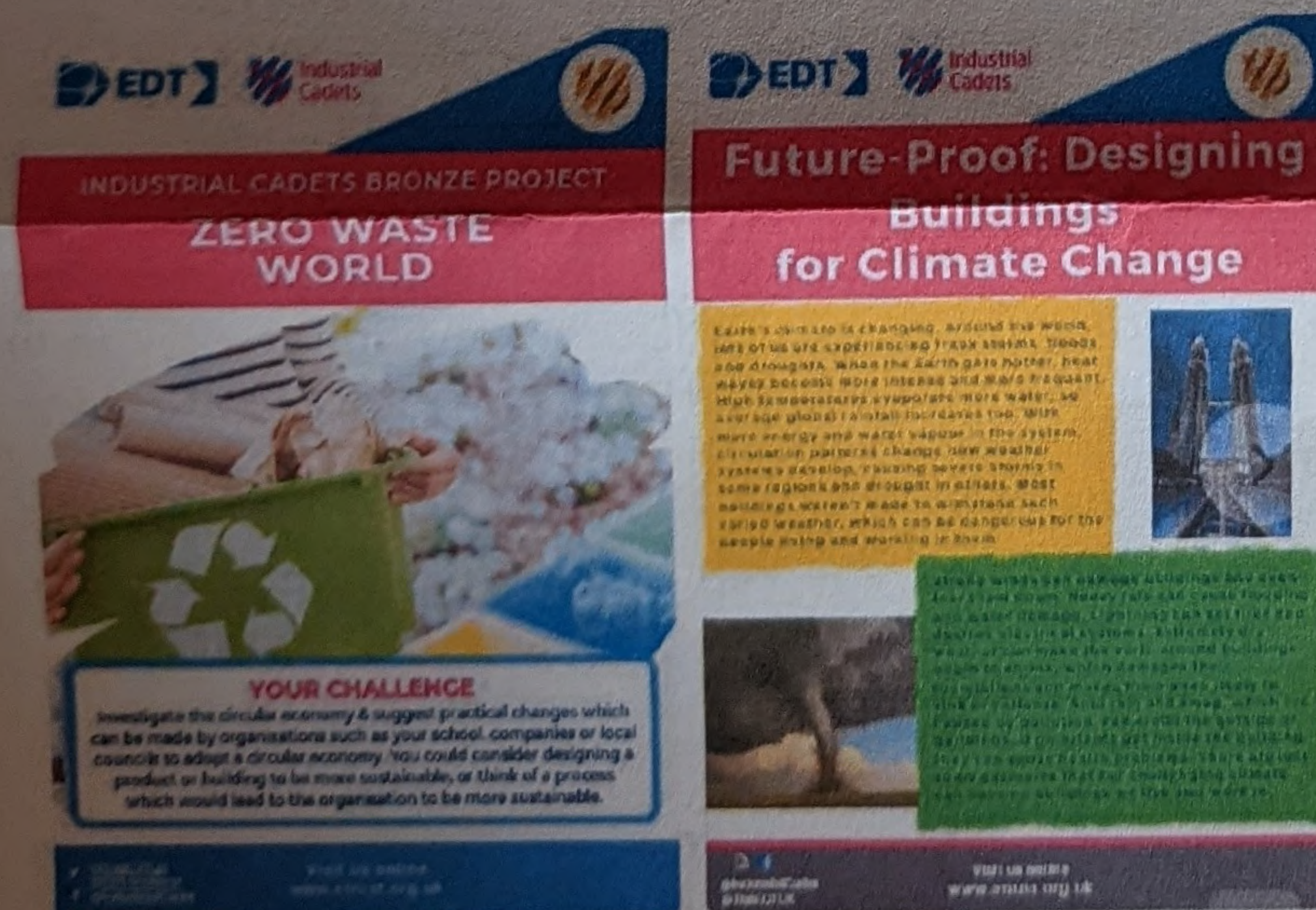
Examples of our environmentally-themed Industrial Cadets Bronze projects

EDT delivered Industrial Cadets Bronze projects to over 200 schools across the UK, and feedback from projects including Industrial Cadets Bronze showed that 97% of students improved their STEM & employability skills/knowledge by taking part.