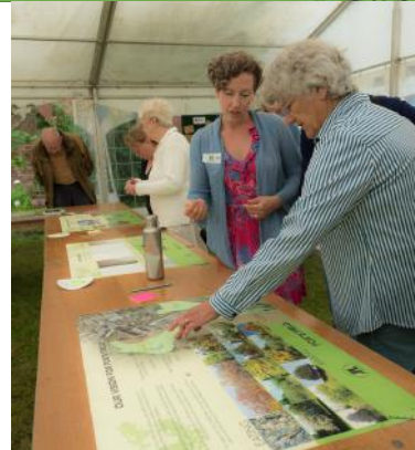
Shots from the 3 rd community consultation day, August 2020