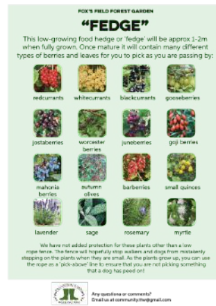
(L) Helen Gillingham with planting plan, measuring out the location of each tree and bush. (R) sign for the food hedge or 'fedge' that marks the edge of the forest garden