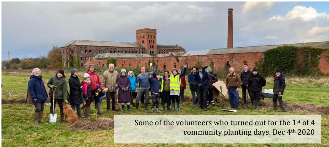
Some of the volunteers who turned out for the 1 st of 4 community planting days. Dec 4 th 2020