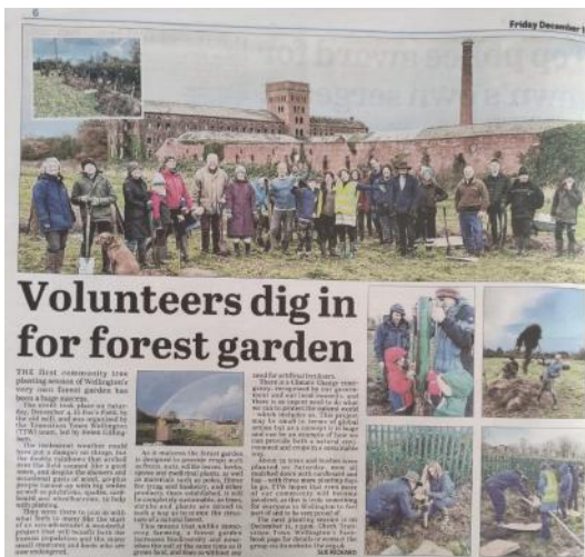
One of several articles on the project in the local newspaper, Wellington Weekly News.

The grant from Nineveh has been spent as follows: